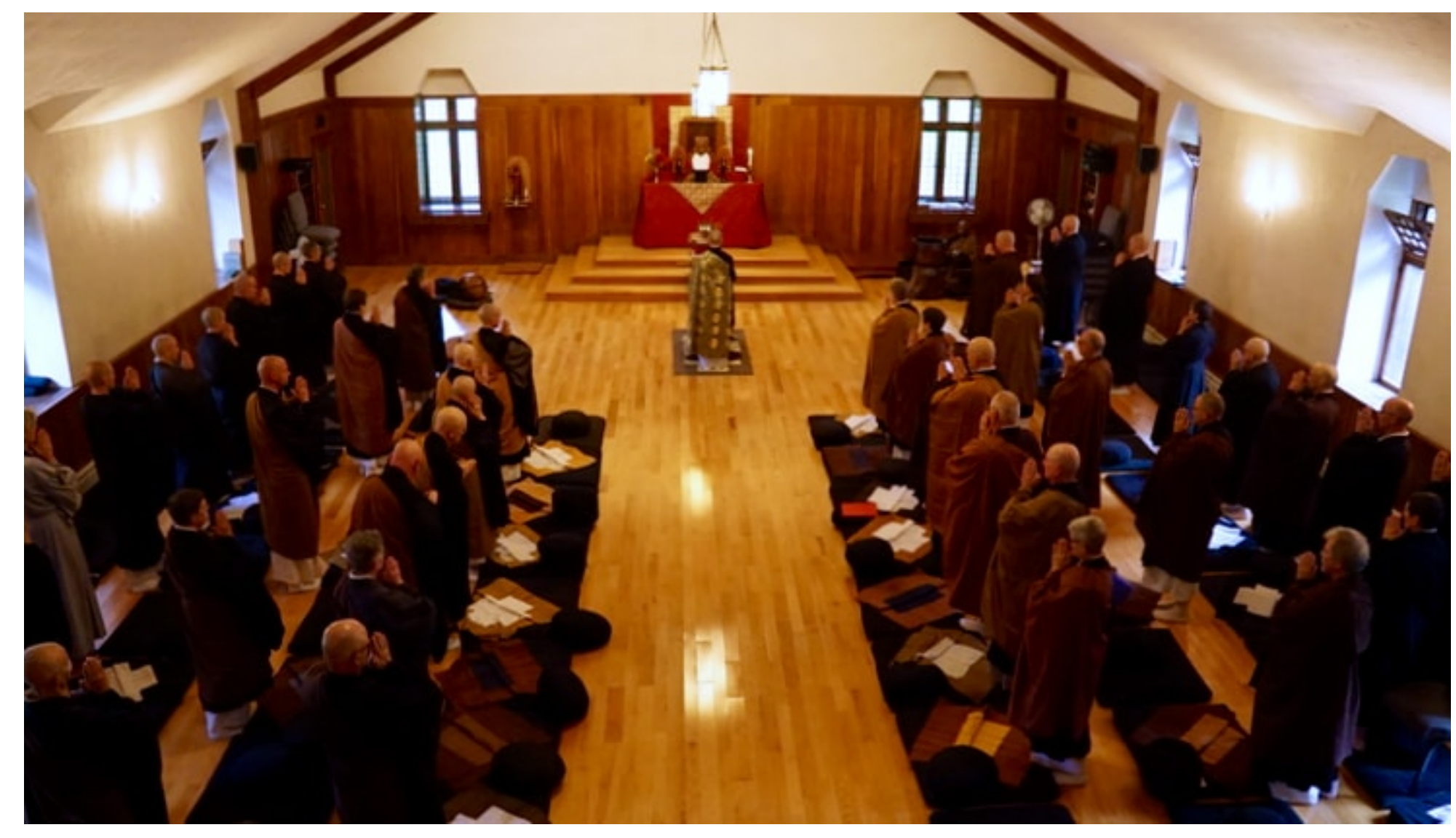
Priests gathered for the eighth biennial Soto Zen Buddhist Association conference.

Seventy members of the Soto Zen Buddhist Association (SZBA) met in Ulster County, New York, for the organization's eighth biennial conference. At the fourday gathering, members of the SZBA — which is a professional association of Soto Zen priests — explored diversity, equity, and the many ways Soto Zen priests express the dharma.