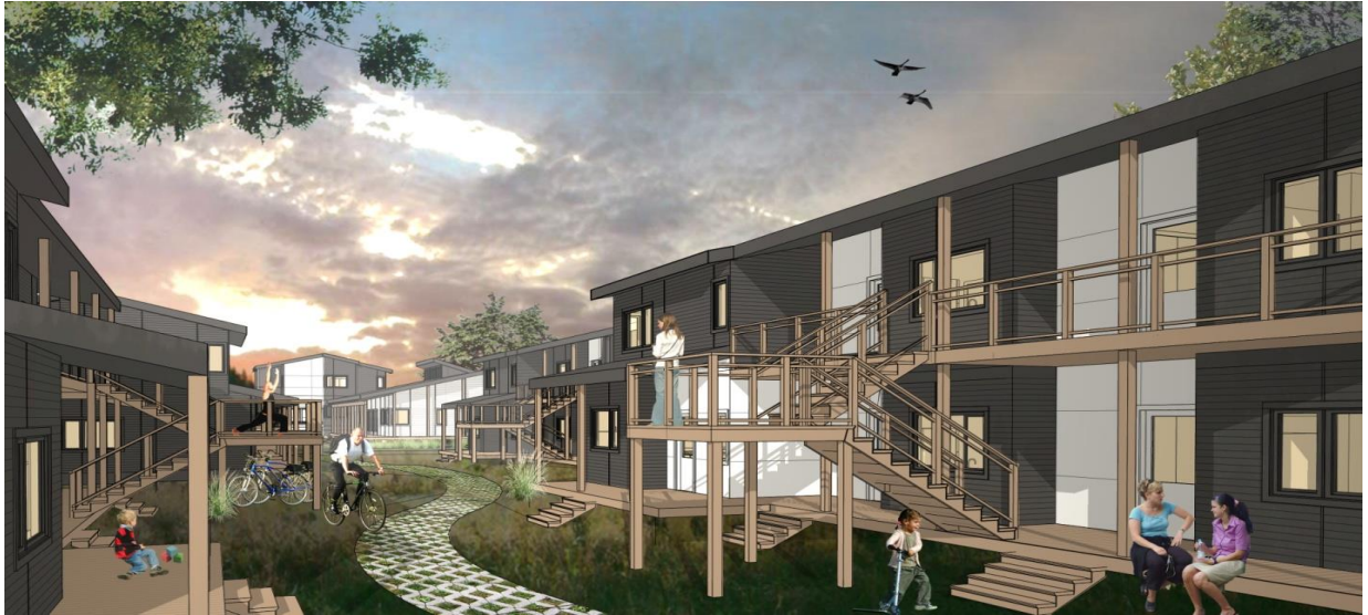
Perspective drawing showing the view through the center of the Householder Refuge.

"There are these four grounds for the bonds of community. Which four? Generosity, kind words, beneficial help, consistency. These are the four grounds for the bonds of community." --The Buddha